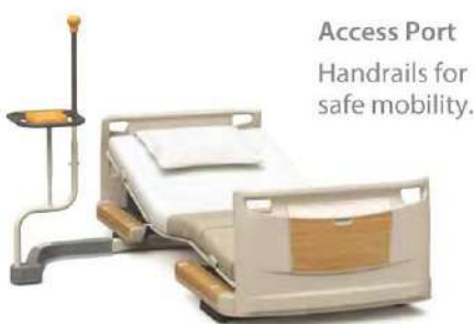
Access Port Handrails for safe mobility.