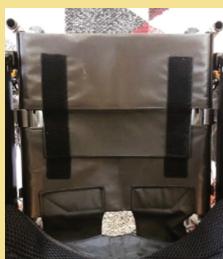
seat depth adjustment