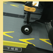
Additional wheels to prevent the footrest from colliding with the floor at different levels.